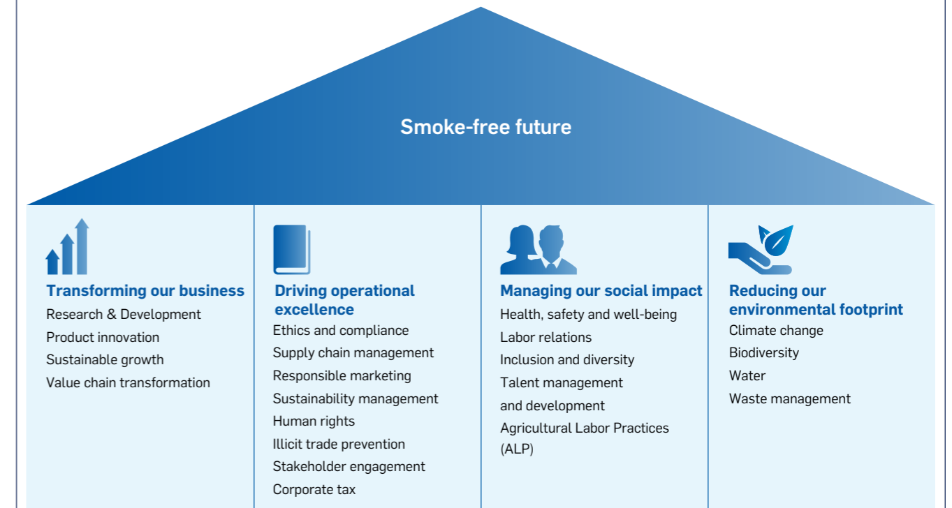
Figure 3 PHILIP MORRIS INTERNATIONAL'S SUSTAINABILITY STRATEGY

smoke-free products by 2025. Based on that ambition, we project that, by the same year, at least 40 million PMI cigarette smokers will have switched to smoke-free products (see Figure 2).