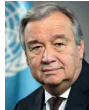
H.E. António Guterres UN Secretary-General

All rights reserved. You may not modify, copy, reproduce, republish, upload, post, transmit or distribute in any way any material, including photos, without the express written consent of macondo publishing.